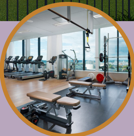
Fully Equipped Gym

Applied for IGBC Green Homes Gold Rating