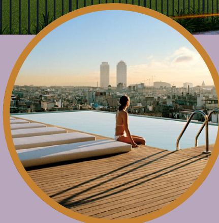
Roof Top Pool